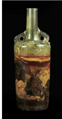
Figure 1. Speyer wine.

Barbaricum in the first centuries of the current era. It was found in Speyer, a town located on the Rhine in the state Rhineland-Palatinate in Germany. This wine, dating back to 325 AD, is preserved in a greenish-yellow, cylindrically shaped glass bottle with two dolphin-shaped handles and was retrieved from a tomb of a man and a woman of Roman origin [7].